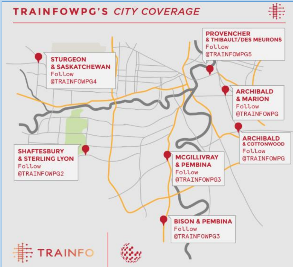
Screenshot of TRAINFO Map

Analytical Approaches Identification, Location